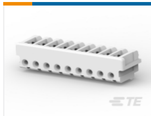
TE Part # CAT-AM7017-H8172 AMP COMMON TERMINATION HOUSINGS