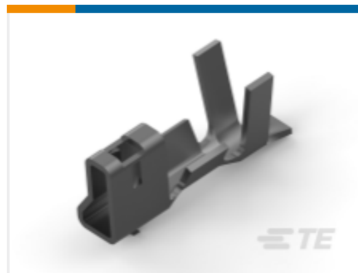
TE Part # CAT-AM7017-C7671 AMP COMMON TERMINATION CONTACTS