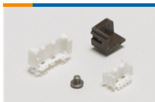
PCB Connector Mounting(46)