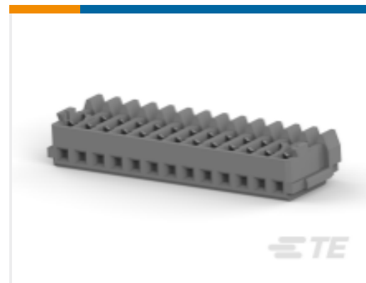
TE Part # 1-353293-3 MINI CT MT REC ASSY 13P GRAY